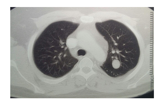
Figure 1. Computed tomography scan of lung without intravenous contrast shows an oval well-circumscribed mass lesion in the left upper lobe

Cushing's syndrome is characterized by the symptoms and signs of prolonged exposure to excess levels of free plasma glucocorticoids. It is classified into two groups; ACTH-dependent (80%) and ACTH-independent (20%). Among ACTH-independent causes, 10%-15% belongs to ectopic