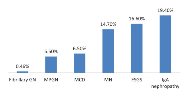
Figure 2. Frequency of primary glomerulonephritis in the kidney biopsies studied (n = 137/217).