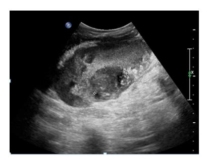
Figure 1. Ultrasonography image of transplanted kidney shows well defined hypoechoic lesion in cortex of mid pole

graft vessels were done in our radio diagnosis department. It displayed normal size transplanted kidney in left renal fossa with about 3.1 × 2.8 cm size hypoechoic lesion in mid pole without vascularity (Figure 1). There were no hydronephrosis and normal resistive index (RI) within graft. The patient did not have history of fever, pain, cough or dyspnea. Provisional diagnosis of non-liquefied abscess was kept. The plain chest film was normal. Blood, urine and sputum cultures yielded negative results. Due to non-liquefied smaller sized lesion, aspiration of lesion could not be possible at time of presentation. Therefore, the patient was treated with antibiotic of cefoperazone and sulbactam. Close follow up of lesion was conducted by ultrasonography and blood investigations. During this period patient also underwent plain CT scan and MRI study of abdomen, findings were consistent with USG (Figure 2). Ultimately aspiration of lesion of transplanted kidney became possible after 3 months of diagnosis of